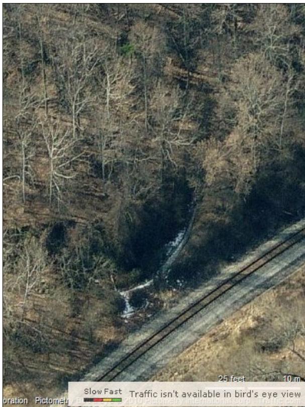
National Web Map Service 6" OPM, c. 2007-08