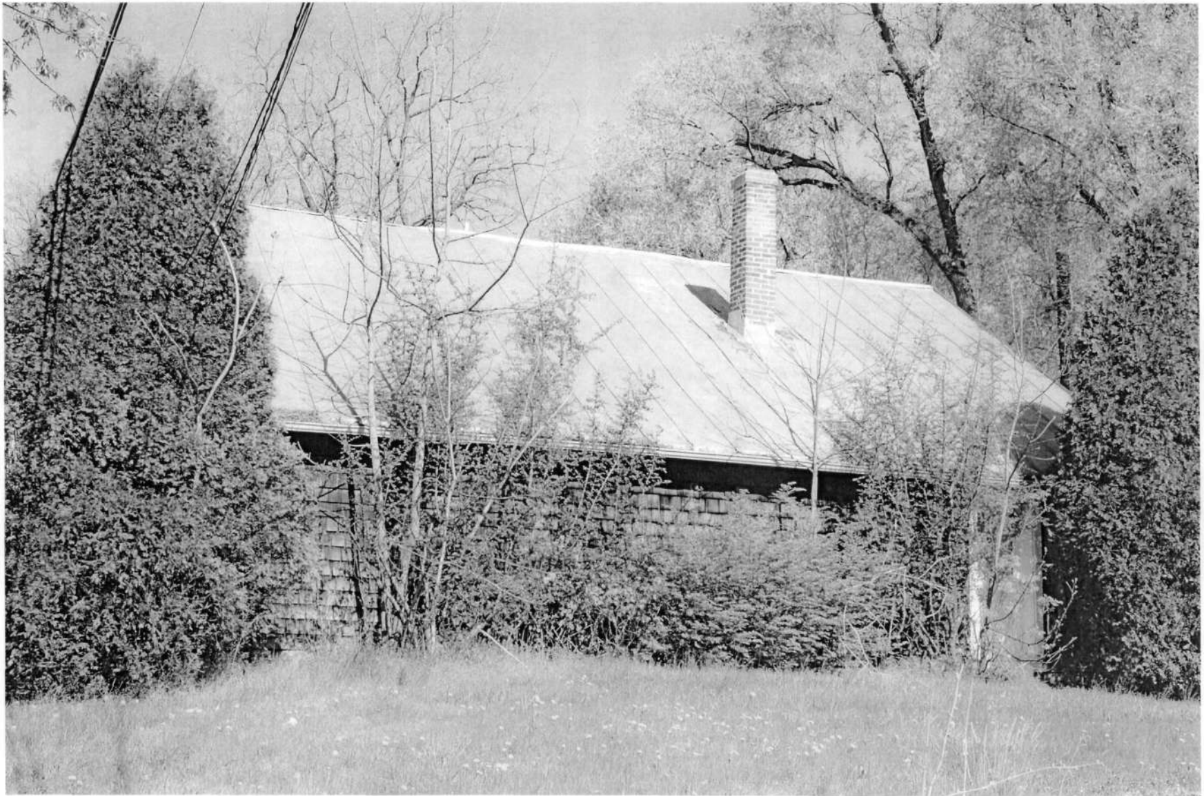
HO-925 Brown's Store and Post Office 14041 Triadelphia Road West elevation Ken Short, April 2006 3/3