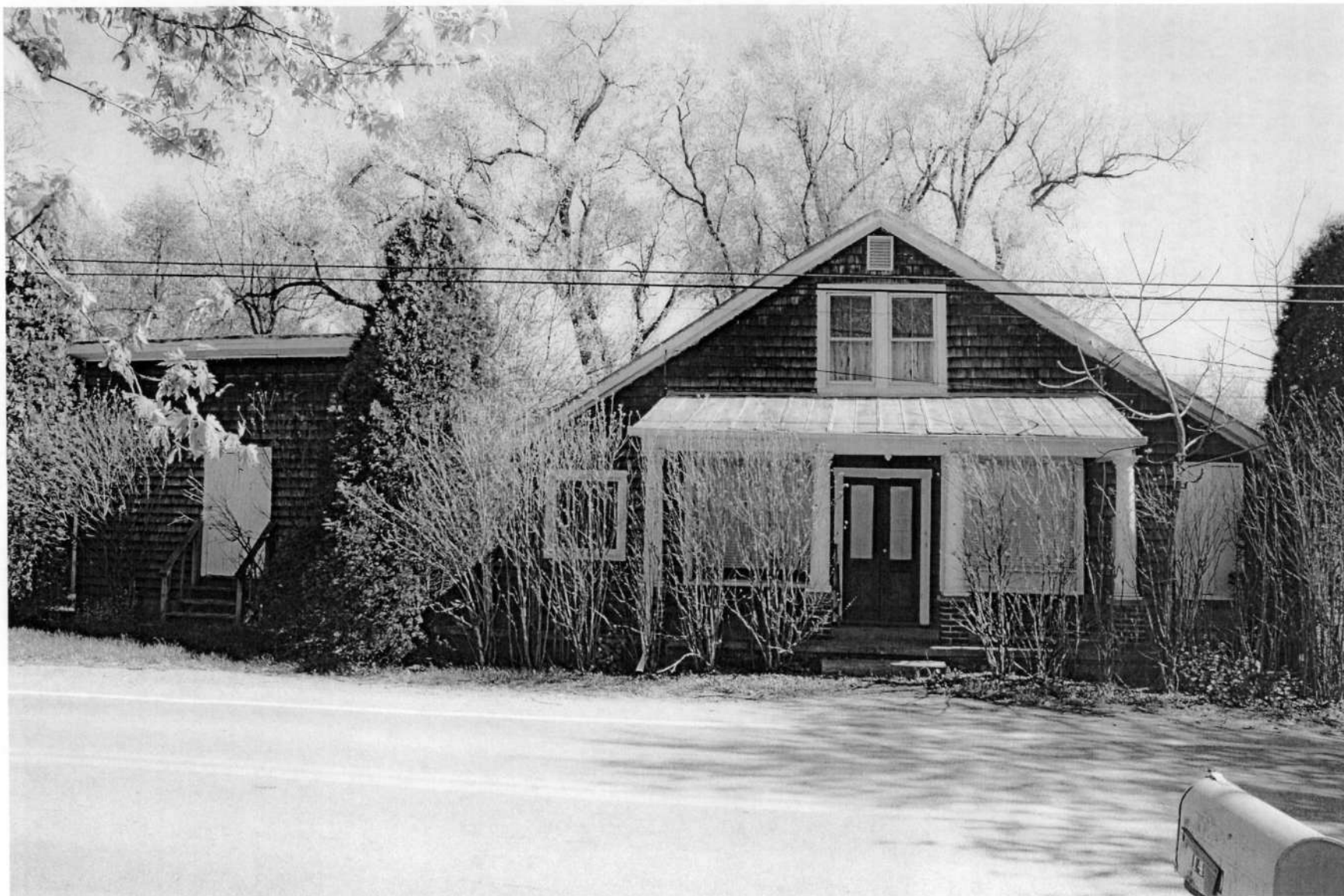
HO-925 Brown's Store and Post Office 14041 Triadelphia Road North elevation Ken Short, April 2006 2/3