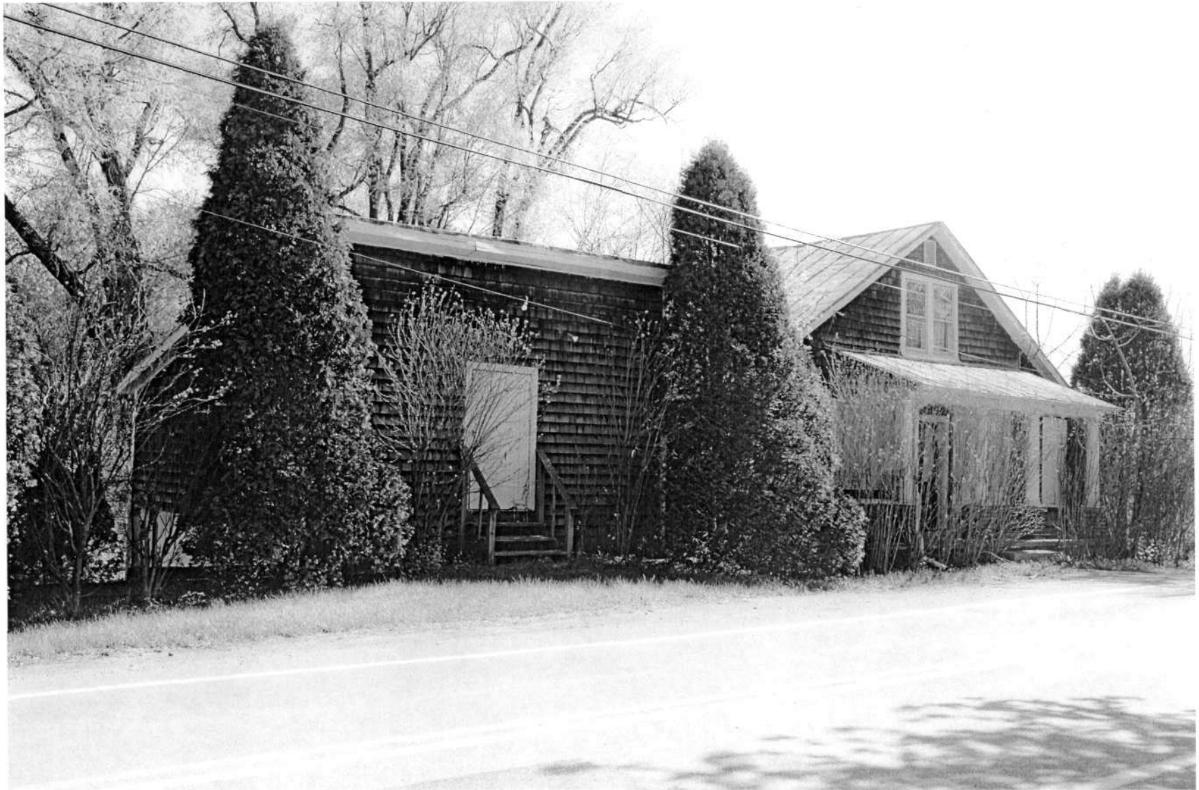
HO-925 Brown's Store and Post Office 14041 Triadelphia Road East & north elevations Ken Short, April 2006 1/3