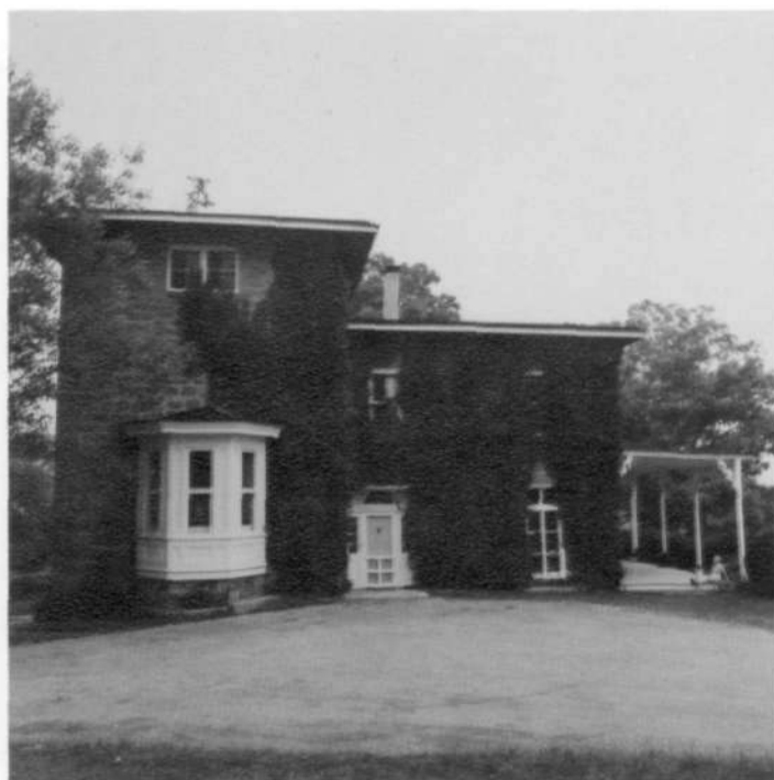
August '75. A broadside of the Manor House of The Oaks from the grassy bank opposite the entrance and bay windows. It had lost much of its ivy covering in a bad March wind. The cistern is partly visible in the rear. I sit directing the photographer, Ron Benden, who did the wedding photographs.