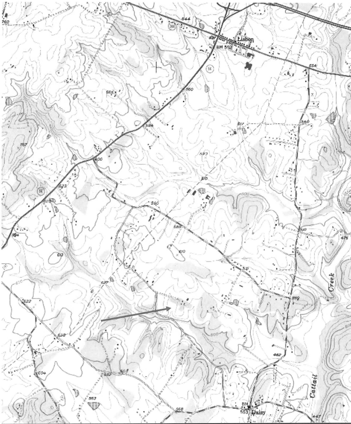
HO-1177 Duvall Family Farm 2435 Duvall Road USGS Woodbine Quad