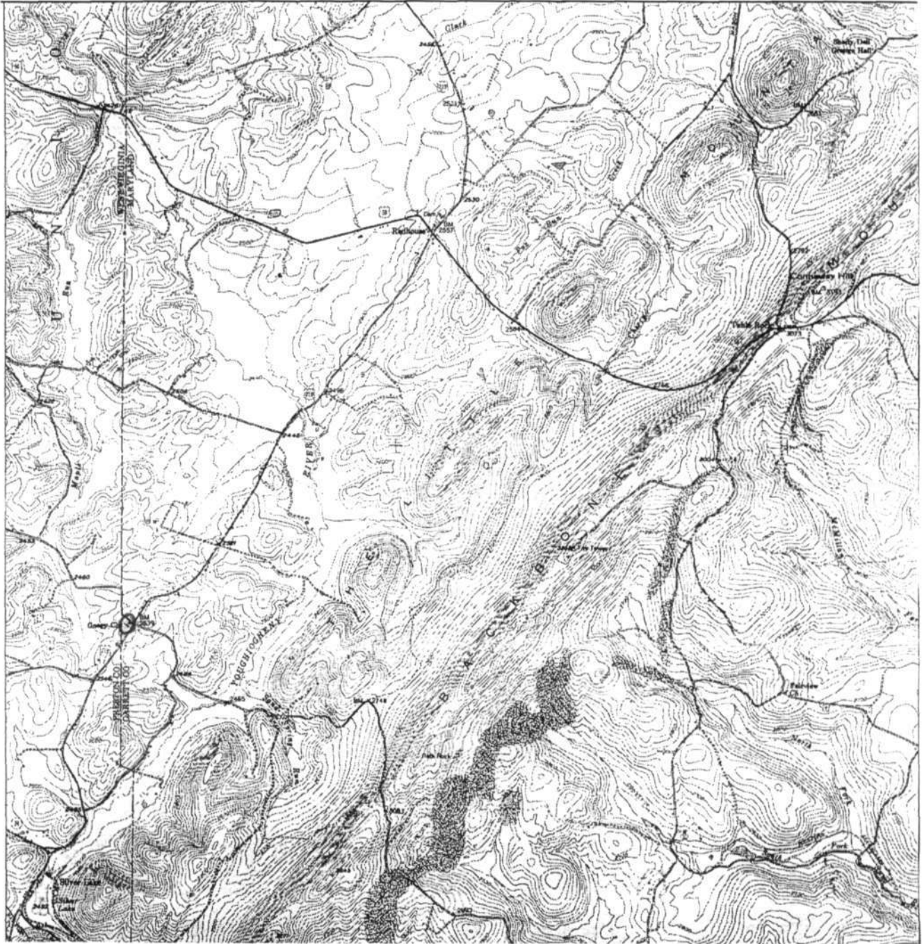
Table Rock, MD/WV USGS Quad Roth Rock Wind Power Project Synergics Energy Services, LLC Backbone Mt., Garrett Co., MD September 9, 2005