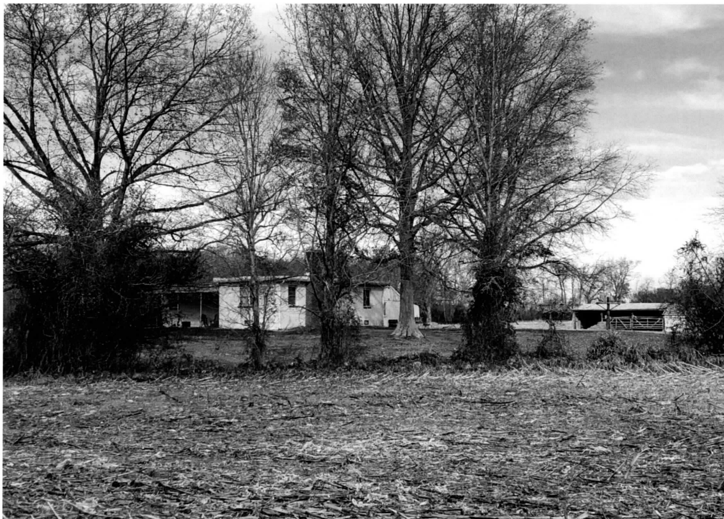
CAR-441_2021-12-07_02 Hadley Property, 18173 Hecht Rd, Henderson, MD. Façade (south elevation) and side (west) elevation, view northwest 12/7/2021