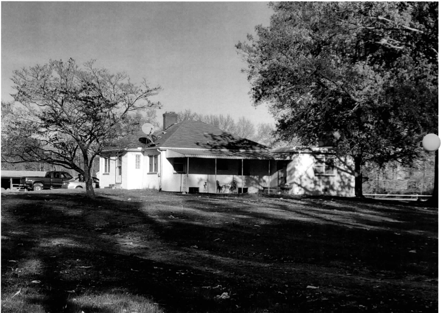
CAR-441_2021-11-18_01 Hadley Property, 18173 Hecht Rd, Henderson, MD. Façade (south elevation) and side (east) elevation, view northeast 11/18/2021