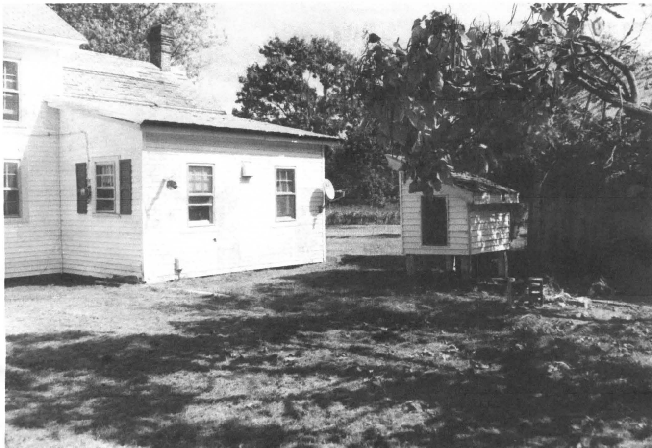
D-836, Todd House, southwest elevation, Toddville, Paul Baker Touart, 10.2013.