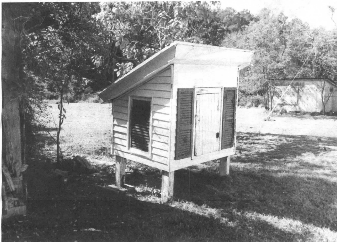
D-836, Todd House, stilted dairy-southeast elevation, Paul Baker Touart, 10.2013