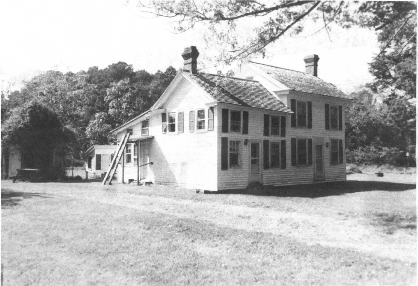
D-836, Todd House, southeast elevation, Toddville, Paul Baker Touart, 10.2013