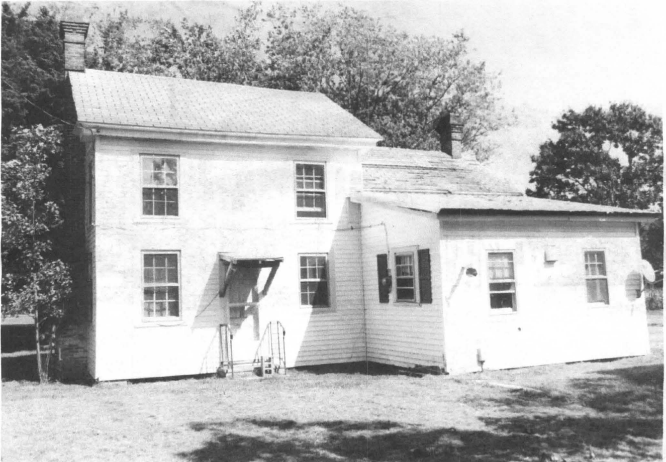
D-836, Todd House, southwest elevation, Toddville, Paul Baker Touart, 10.2013