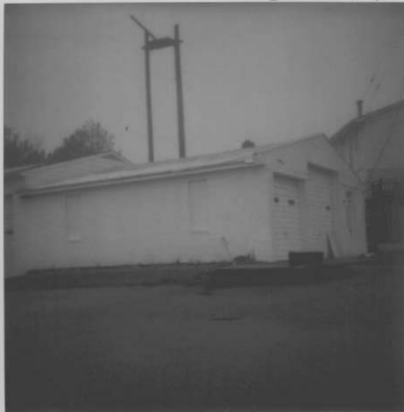
Concrete block bldg. SE corner