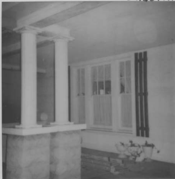
Shipley House - east entrance facade - looking SW toward. Vinyl clad columns/stone faced concrete block plinth.