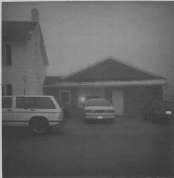
Wantz Construction Co. Looking South