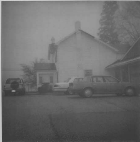
Wantz Construction Co. looking east toward rear of Shipley House