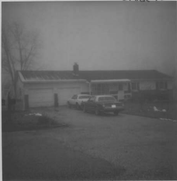
House behind Shipley House on Sandra Lane. (Westminster House in Housing Dev.)