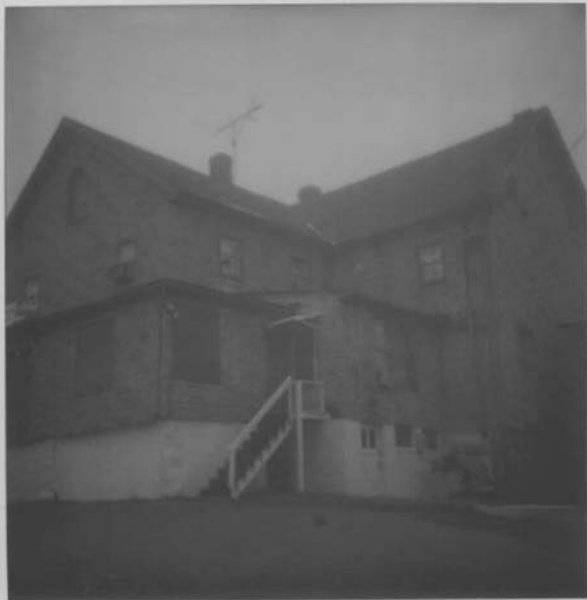
Gamber Store SE corner - detail