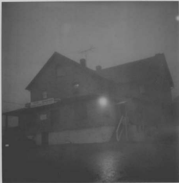
Gamber Store SE corner