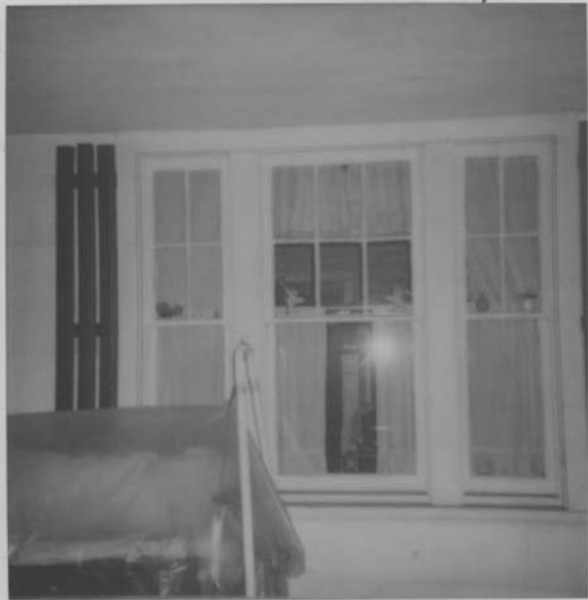
Shipley House east entrance facade tri-partite window.