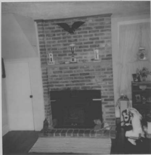
Shipley House Living Room