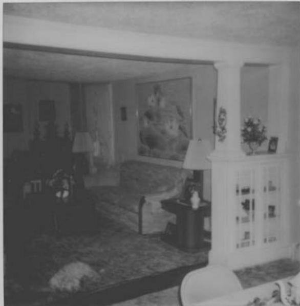
Shipley House Dining Room