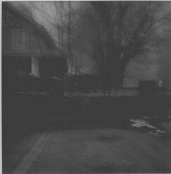
Applewaite Residence with High's Parking Lot in foreground