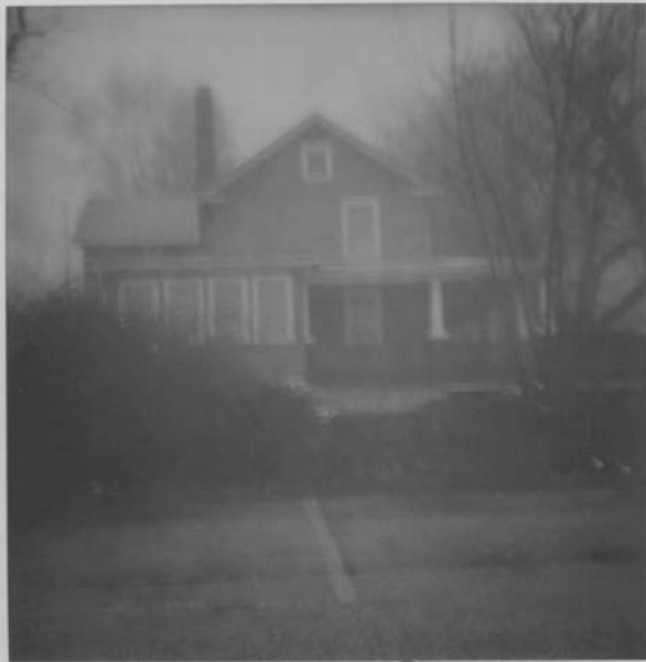
Applewaite Residence South elevation